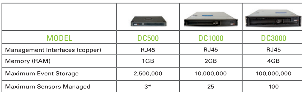
Table 1. Sourcefire Defense Center Appliance Family

All Sourcefire 3D events are sent securely from Sourcefire 3D Sensors to the Defense Center (DC) for centralized analysis and storage. Designed with enterprise deployments in mind, Defense Center is capable of collecting events from up to 100 sensors and handling a maximum of one hundred million events.